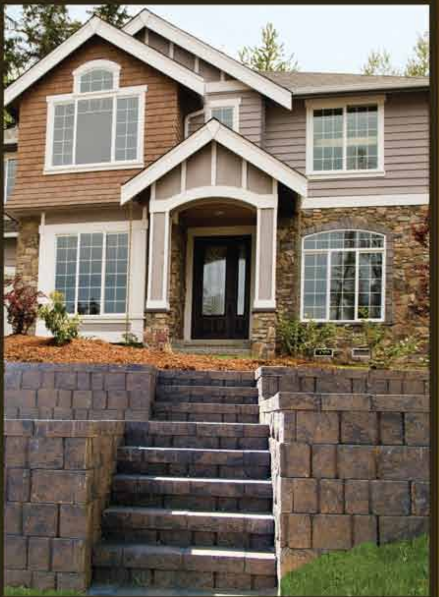
Stairs and steps can easily be designed into Belgado®.

Warm colors exposed in the layers of this beautiful material portray walls worn by weather and age.