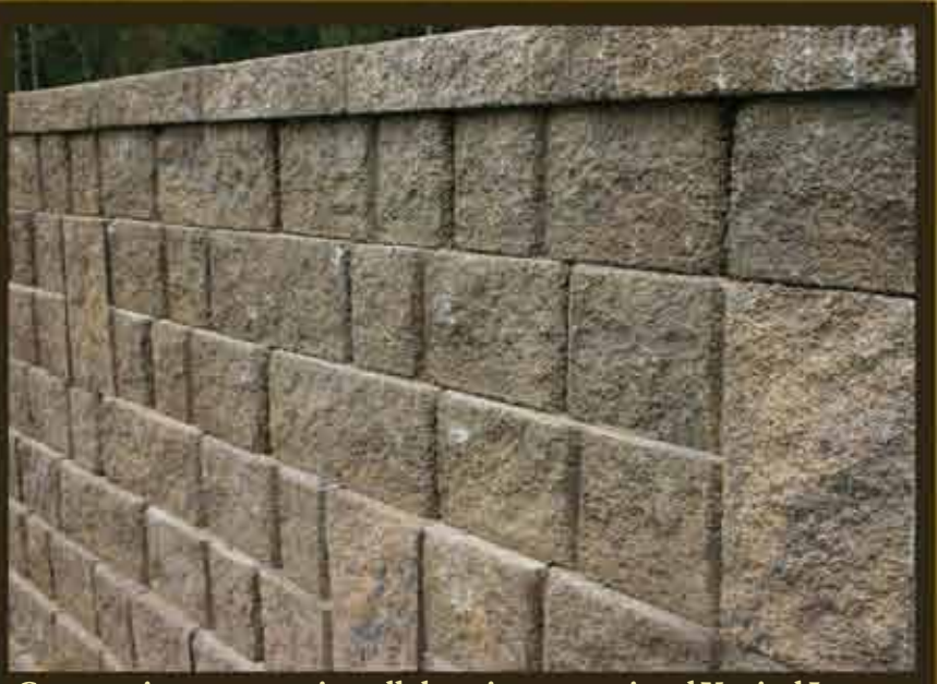
Create unique patterns in walls by using our optional Vertical Jumper.