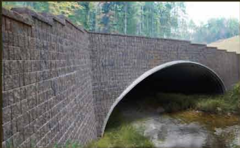
This project uses only Left Headers and Right Headers.

The color palettes are deep, rich and regal with shades of burgundy, navy, ocher and cream, muted for a timeworn effect.