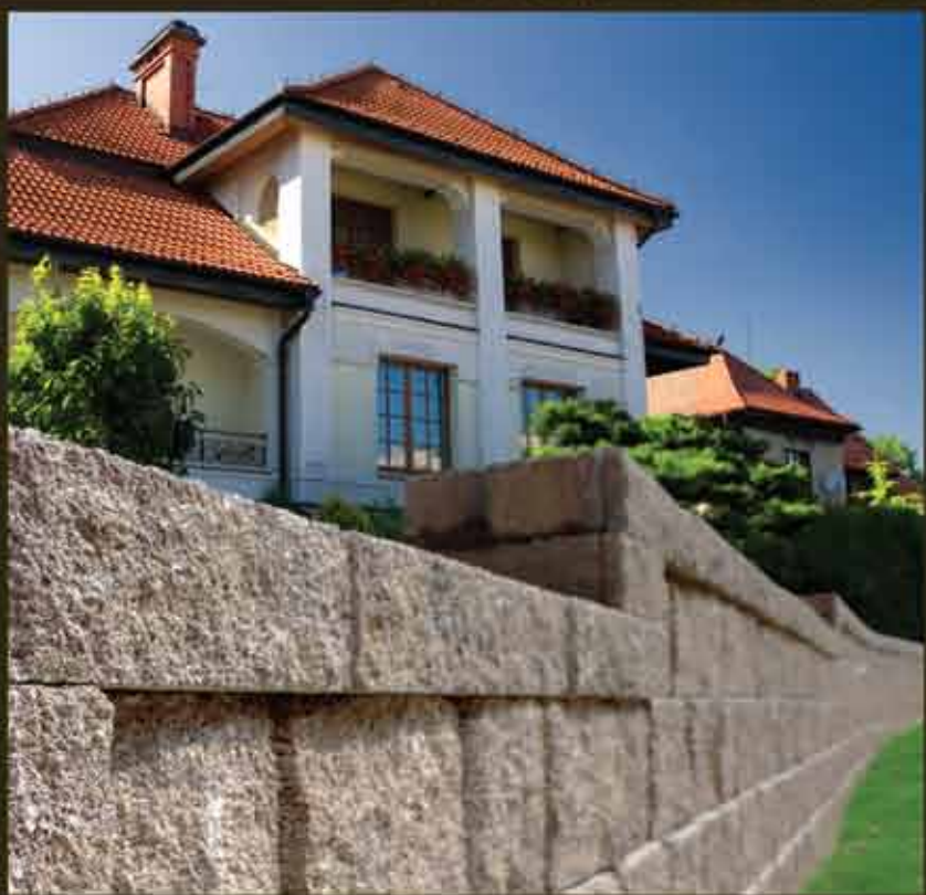
Design Versatility - this project uses Belgado® Stretchers and Headers.

Belgado® was developed by RidgeRock® to provide a beautiful and upscale appearance without sacrificing the structural integrity of the retaining wall project.